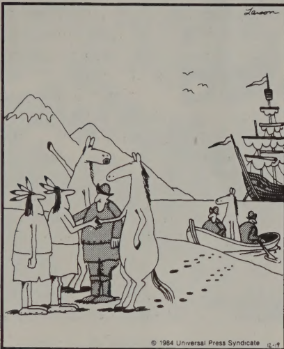
Circa 1500 A.D.: Horses are introduced to America.